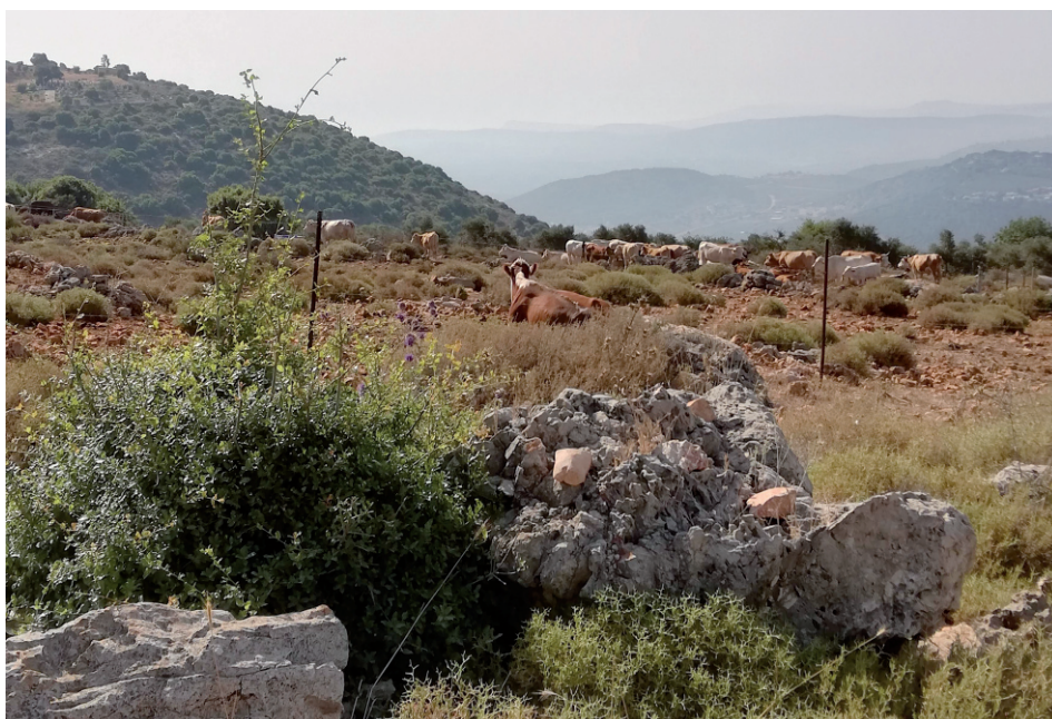
ON THE HEIGHTS OF KARMIEL, WALKING WITH OREN

I wanted to meet real people, listen to them, breathe the same air as them, feel their difficulties, their anguish, without pretending to bring any solution to their problems. A little support perhaps. Support, if possible without borders.