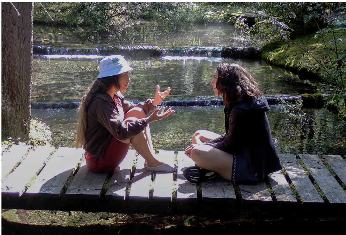
ON TOP: MEETING SNOW AT COL DES CHAMOIS BOTTOM: DBRIEFING DAY AT THE DOMAINE DES SOURCES IN THE DIABLERETS, NOUR AND HUWAIDA