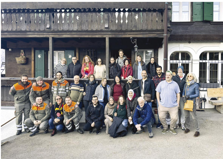
AT THE CHALET IN CHÂTEAU D'EX, WITH THE CIVIL PROTECTION DRIVERS