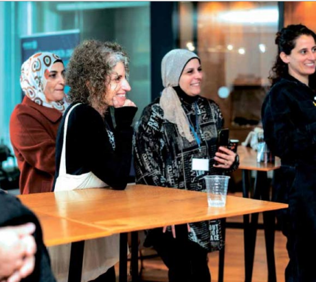
Israeli and Palestinian participants in the hackathon in Tel Aviv, in mid-January. Some 20 professionals showcased their apps in front of colleagues and judges.

“I feel safer in Tel Aviv than I do on my way home. I’m afraid of settlers who stop us and threaten us here. The media on both sides is doing a bad job, hiding what’s actually happening and not reflecting the truth. Until participating in Rozana’s projects, I was sure that every-one who lives on a kibbutz is a settler. I only understood in the past year that