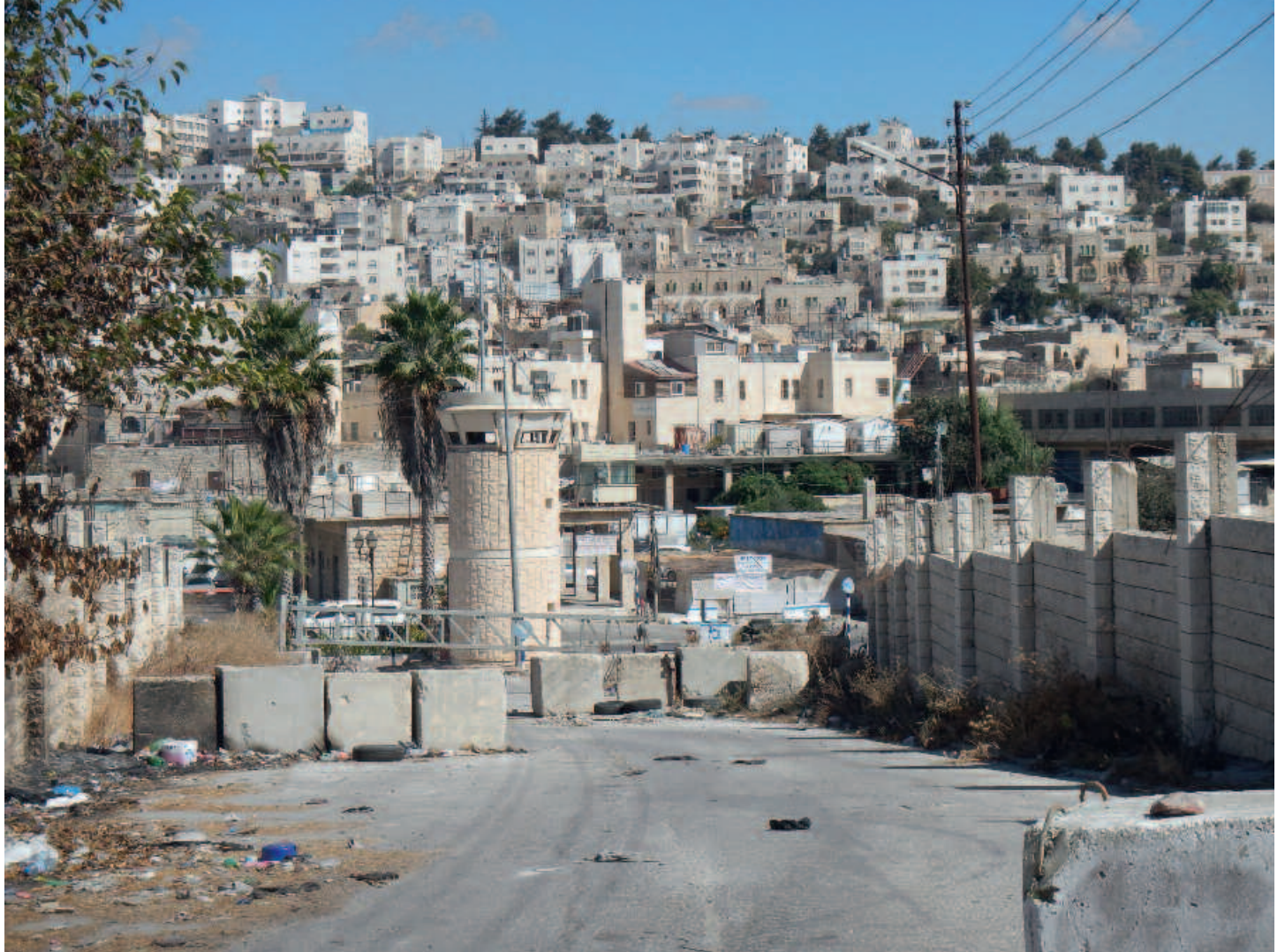
Hebron (or חברון (Hevron) and in Arabic الخليل (Al-Khalil)), 24 October 2016. Town centre and settlement below thus blocking the passage for anyone who does not belong