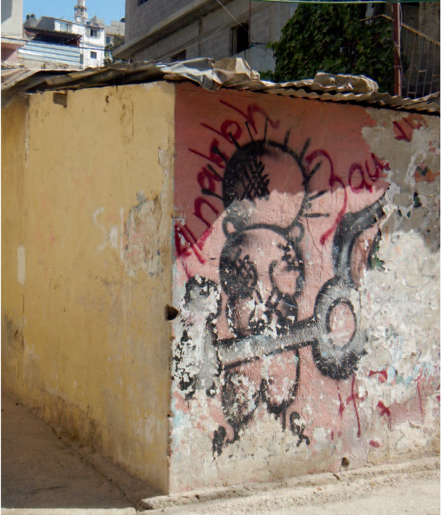
Al Aroub Camp (West Bank, between Bethlehem and Hebron), 26 October 2016. Graffiti