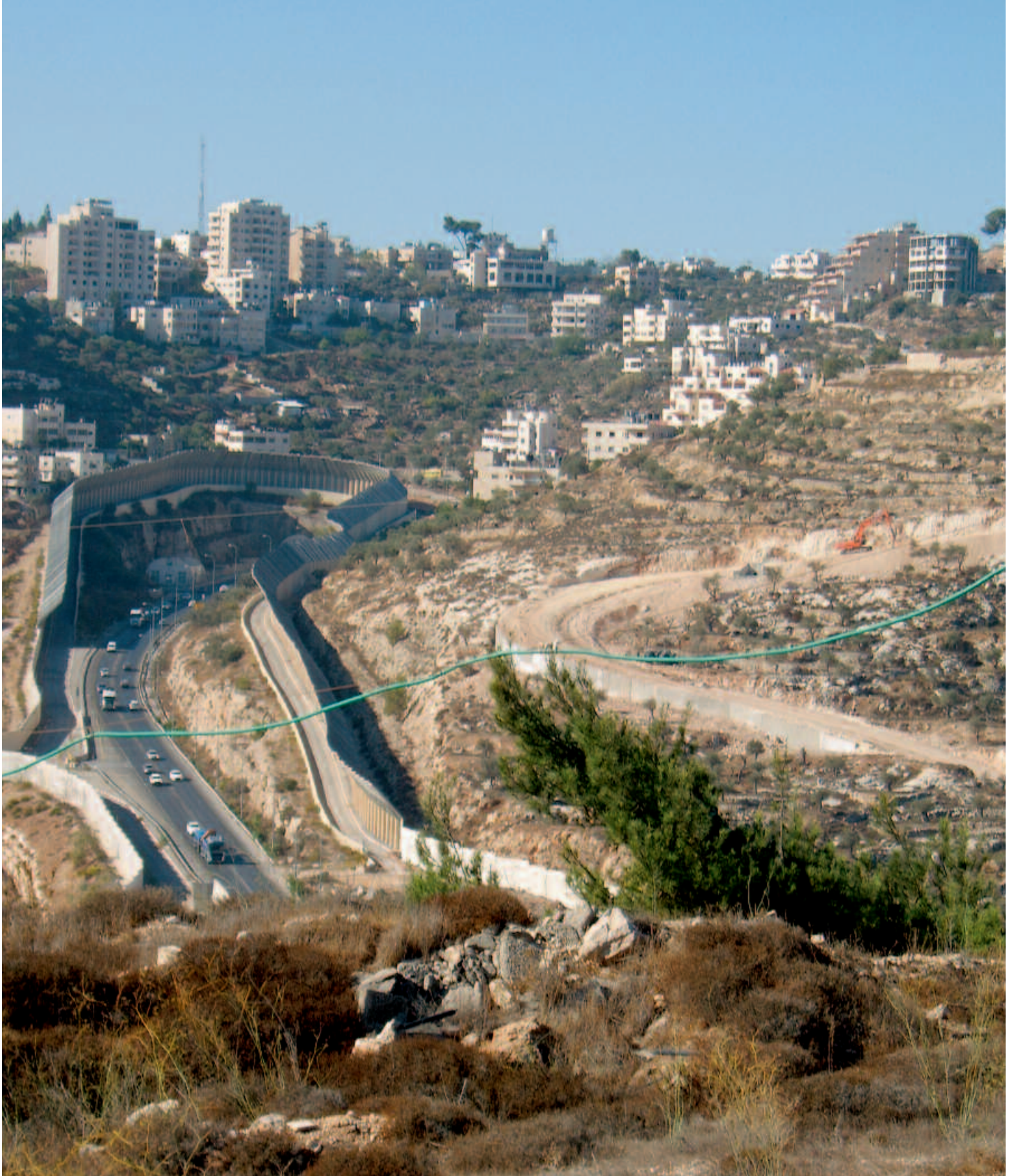
Mosaic: of Jerusalem town hall