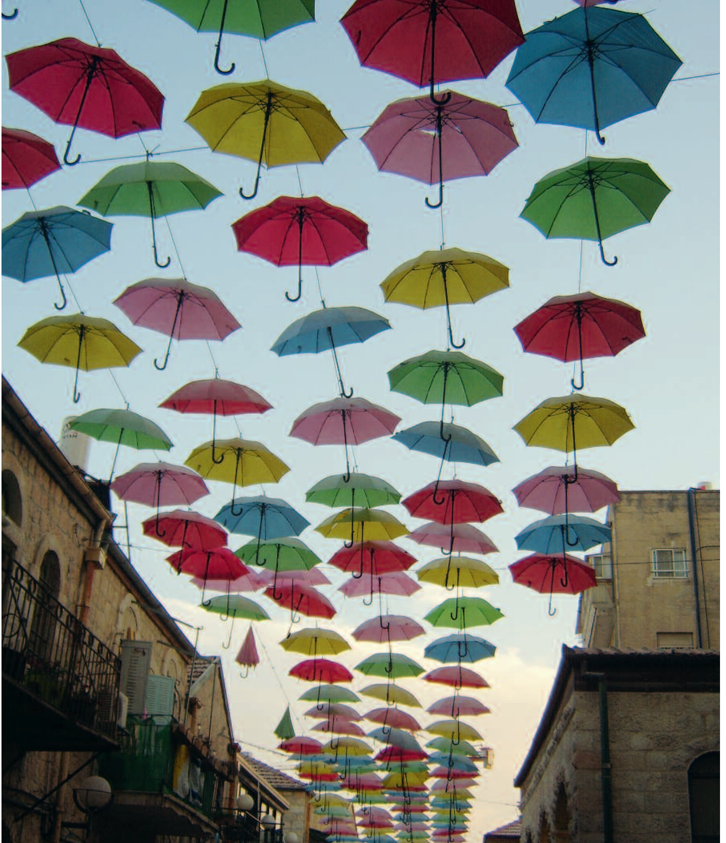
Yoel Moshe Solomon Street, Downtown Jerusalem