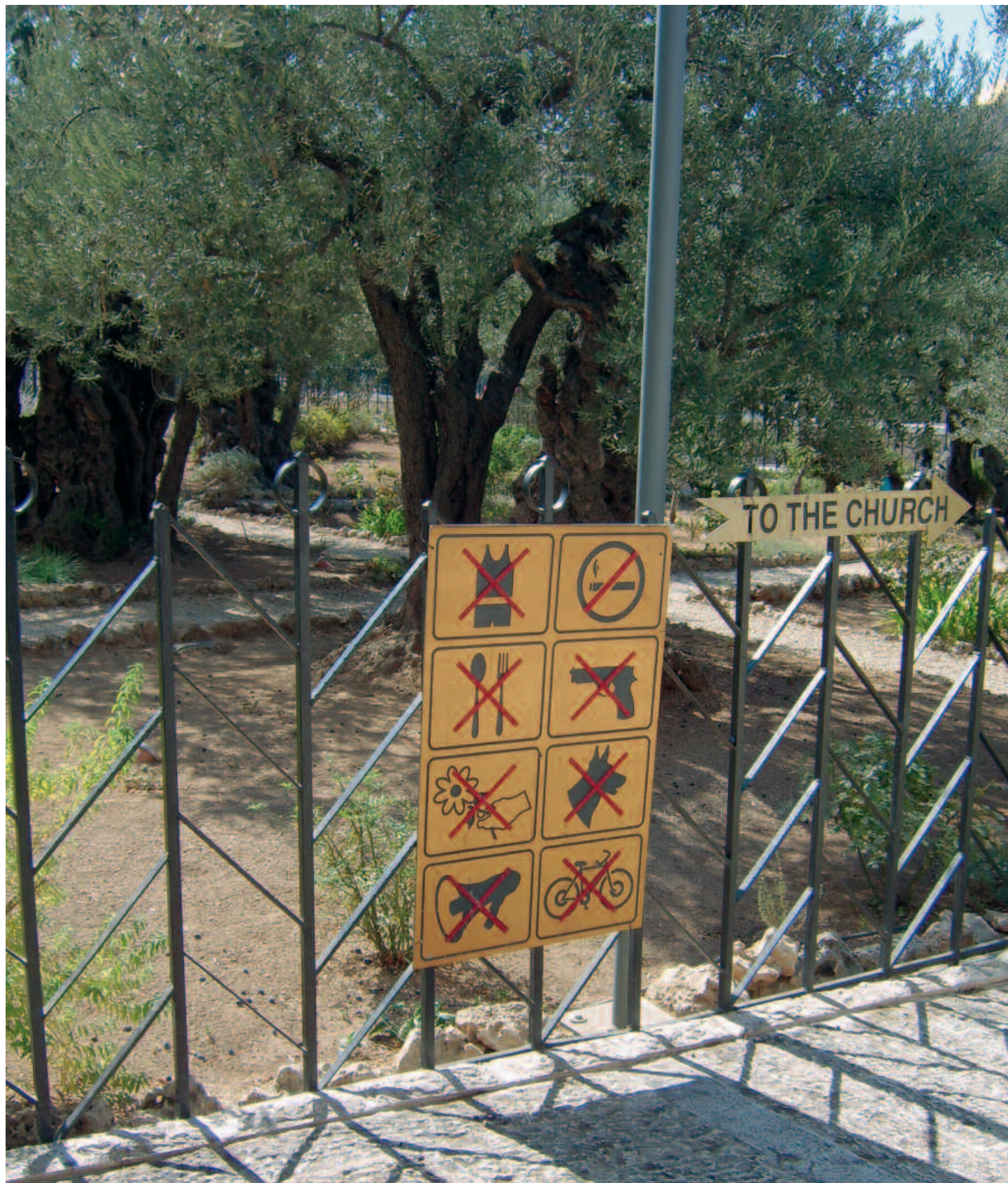
Entrance to the park of the Mount of Olives