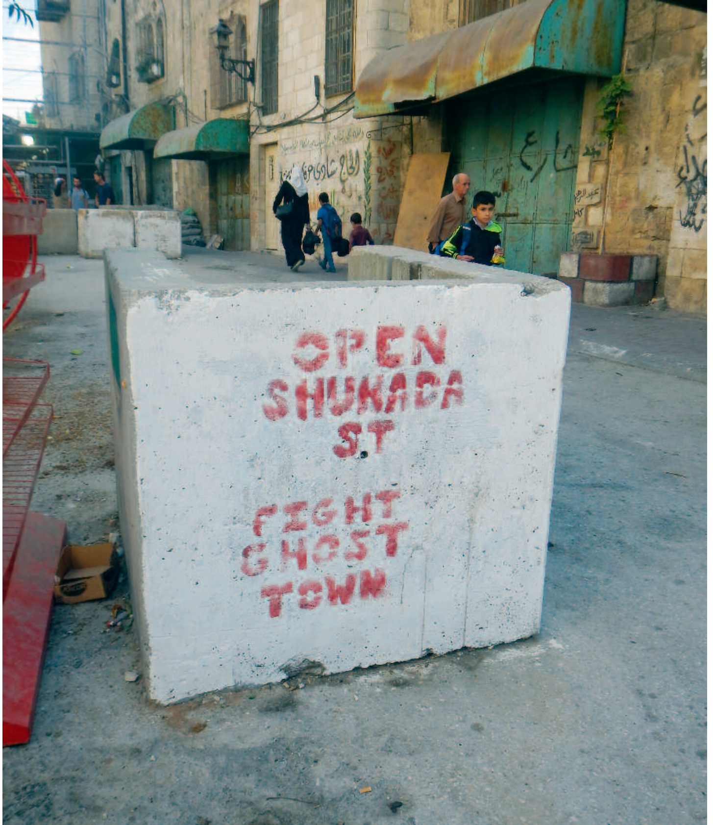
Hebron, 24 October 2016. Same check-point and graffiti