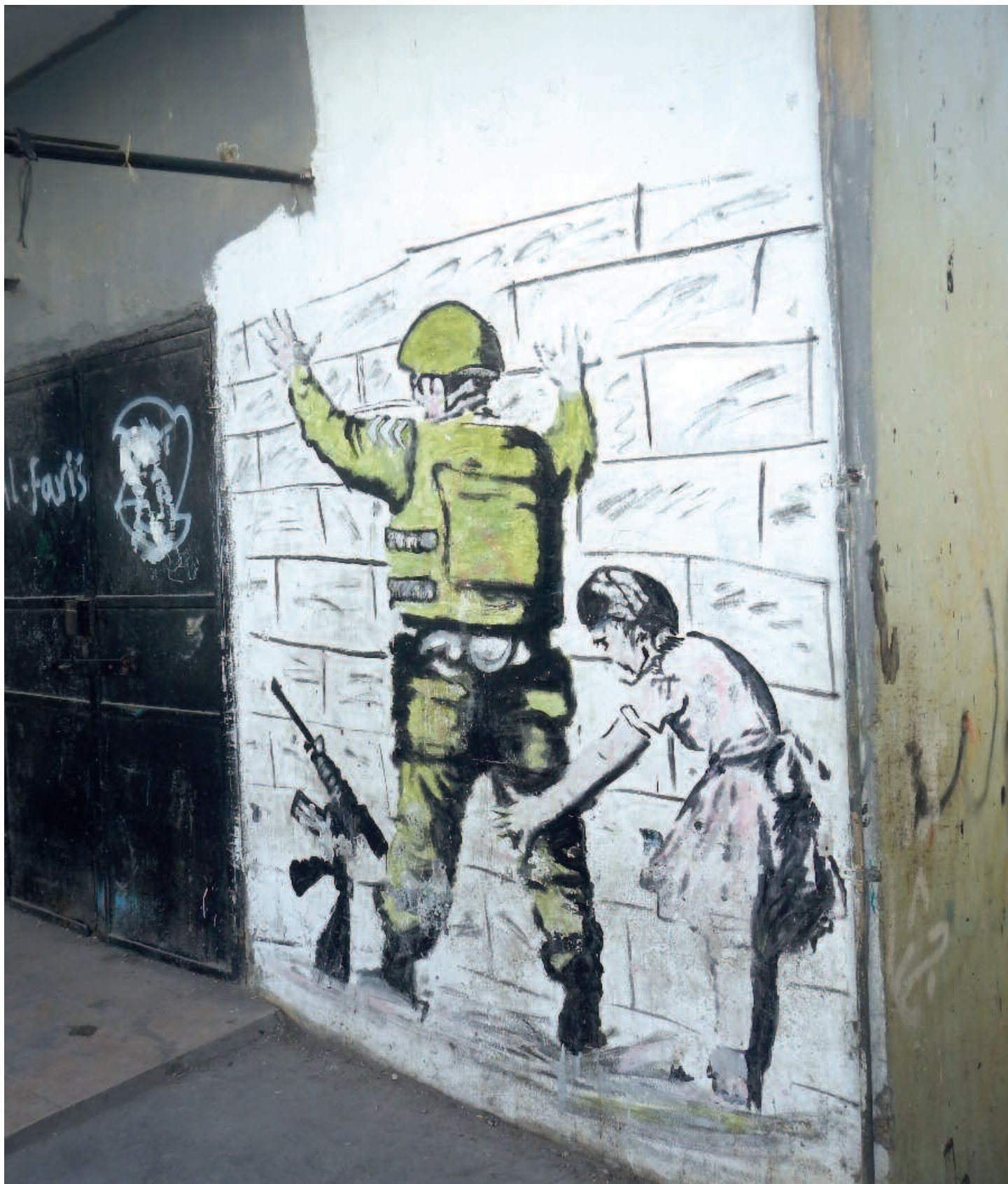
Al Aroub Camp (West Bank, between Bethlehem and Hebron), 26 October 2016. Graffiti