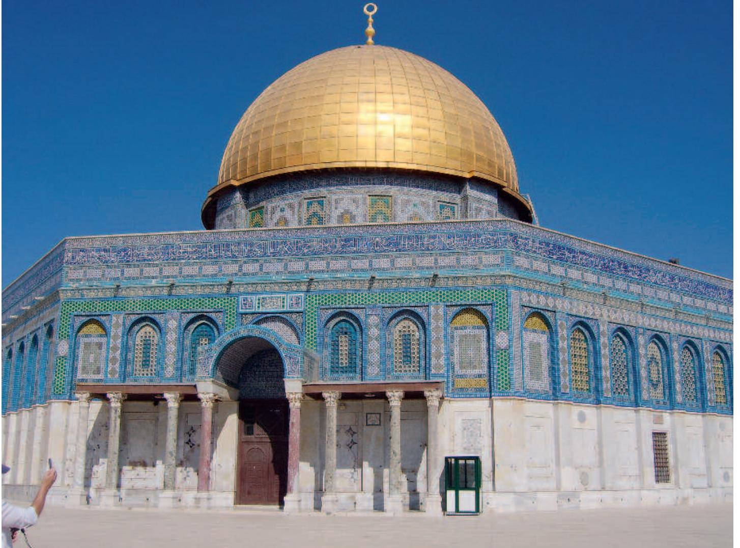
Al-Aqsa Mosque (Mosque Esplanade)