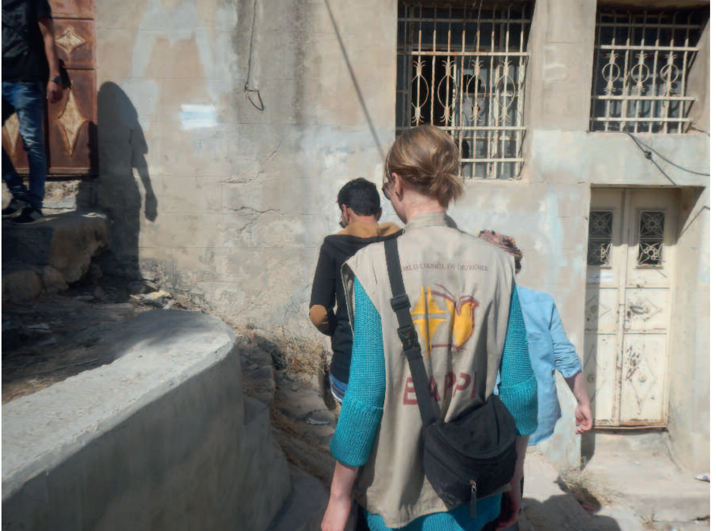
Hebron, 24 October 2016. EAPPI Volunteer (Ecumenical Accompaniment Programme in Palestine and Israel) who secures the passage for non-settlers on a path juxtaposing the settlement in the centre of Hebron